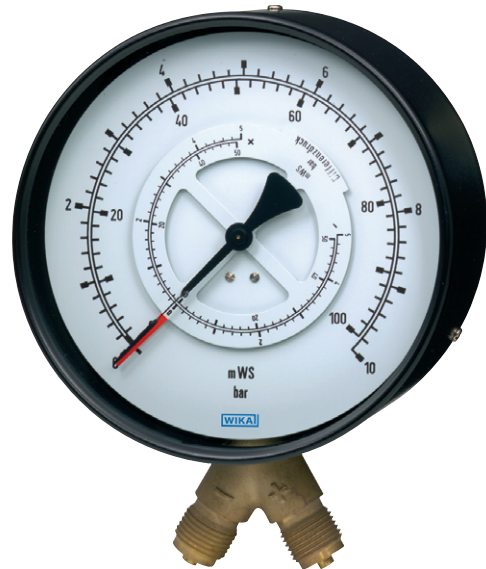
Differential Pressure Gauge Model 711.11