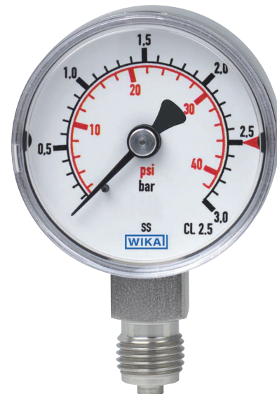
Bourdon tube pressure gauge model 131.11.50 with 2nd scale psi